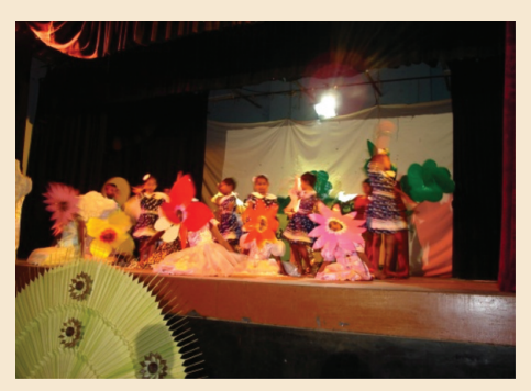
Children Performing at the Concert