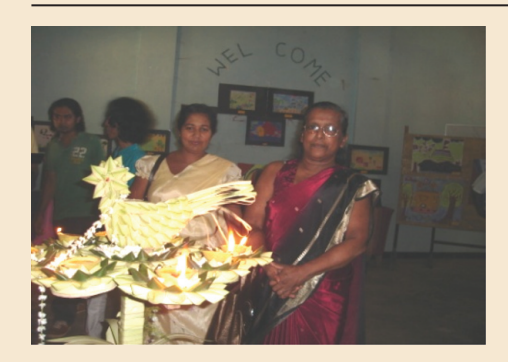
Inauguration of the Concert & Art Exhibition