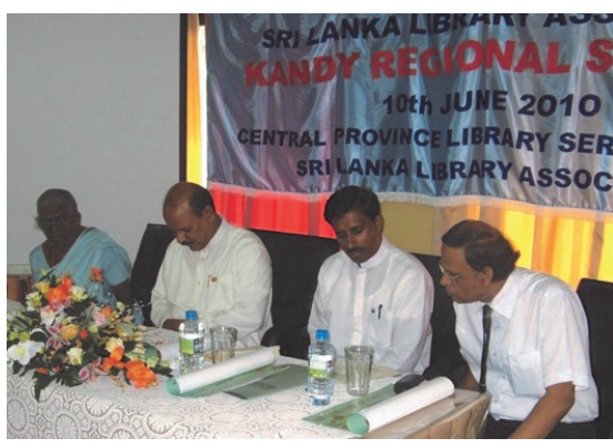
SLLA Golden Jubilee Regional Seminar in Kandy was held on 10th June 2010.