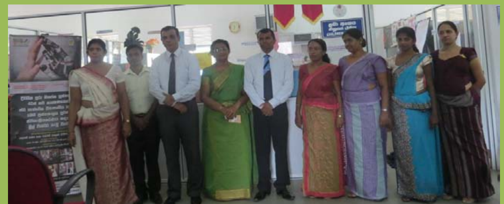
Nawalapitiya Public Library : All staff members with Project team