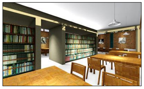
VIEW FROM ENTRANCE LOBBY